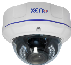
XVDHDA28V12Q-1080 XWB-VD (Wall Bracket)