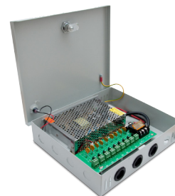
XPSU1209 (0498750) 9 channel 12VDC PSU