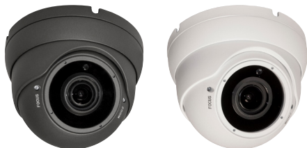
XEDHDA28V12Q-1080 XEDHDA28V12QW-1080 XEDHDA28V12AQ-1M3 XEDHDA28V12AQW-1M3

For compatible junction boxes and spacers, please see page 3.