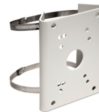
XPTZ-PMA Pole mount adaptor