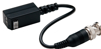
XBALUN2 (0498780) UTP balun