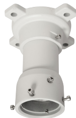
XPTZ-ADP Ceiling / tower bracket