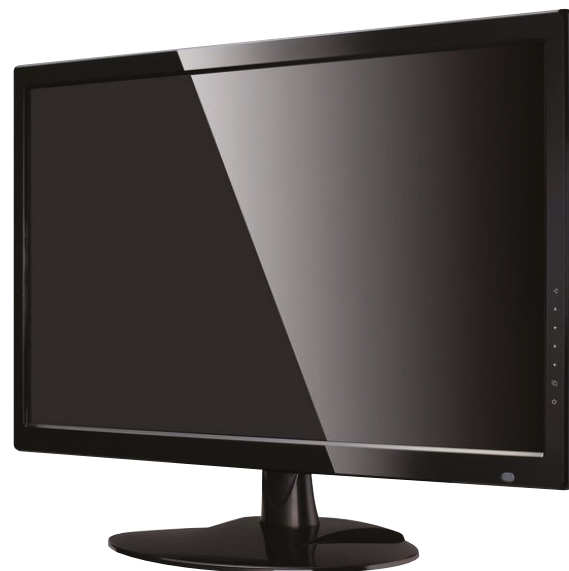
XLCD21WLEDe 21" Monitor