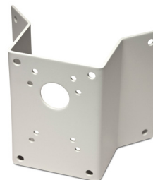
XPTZ-CMA Corner mount adaptor