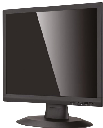
XLCD19LEDe 19" Monitor